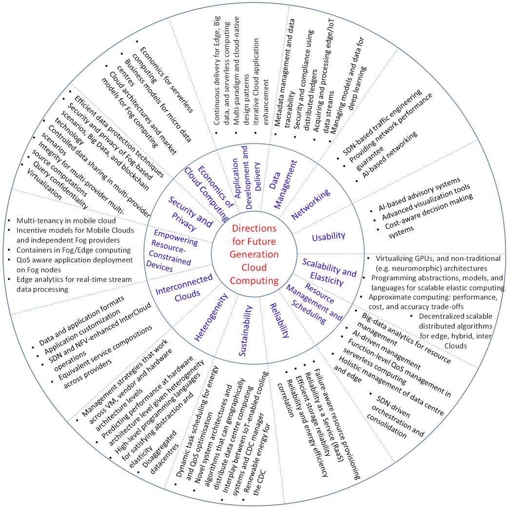
Fig. 3. Future research directions in the Cloud computing horizon

computational tasks such as CPU, memory and storage, will be built as stand-alone resource blades, which will allow faster and ideal resource provisioning to satisfy different QoS requirements of Cloud based applications. The future research directions proposed for addressing the scalability, resource management and scheduling, heterogeneity, interconnected Clouds and networking challenges, should enable realizing such comprehensive IaaS offered by the Clouds.