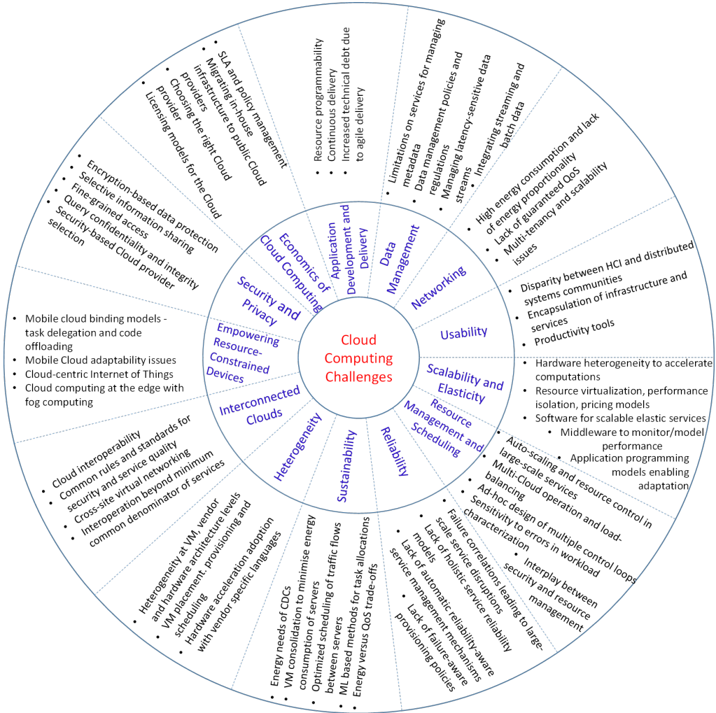
Fig. 2. Cloud computing challenges, state-of-the-art and open issues